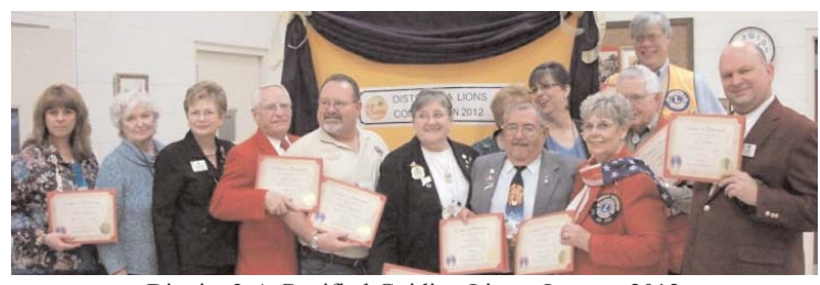
District 3-A Certified Guiding Lions, January 2012

Ponca City Noon: Held main fundraiser, annual auction, with a net of $16,330. Worked on Diabetes Walk. Wakita: Donated $100 in support of the Medford FFA-4-H stock show premiums. Planning for annual pancake supper.