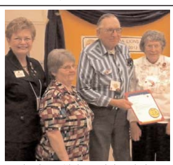
Nash Lions Club receiving their 75-Year Banner patch.

<u>Nash</u>: Making plans for annual Memorial Day Dinner. Placing flags on Veterans' graves..